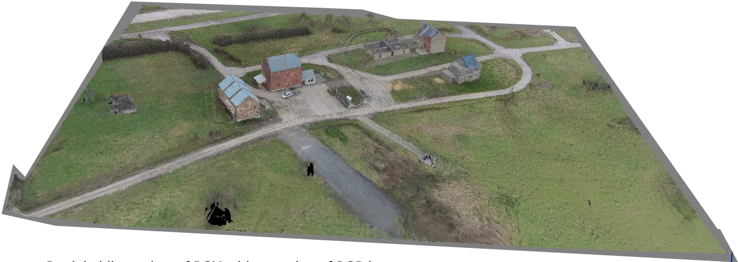
Partial oblique view of DSM with mapping of RGB image